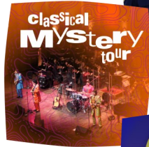
Music of The Beatles Oct 5