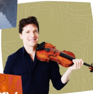
Joshua Bell, violin Sep 28