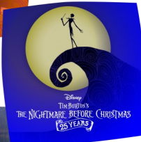
Film in Concert Nov 1